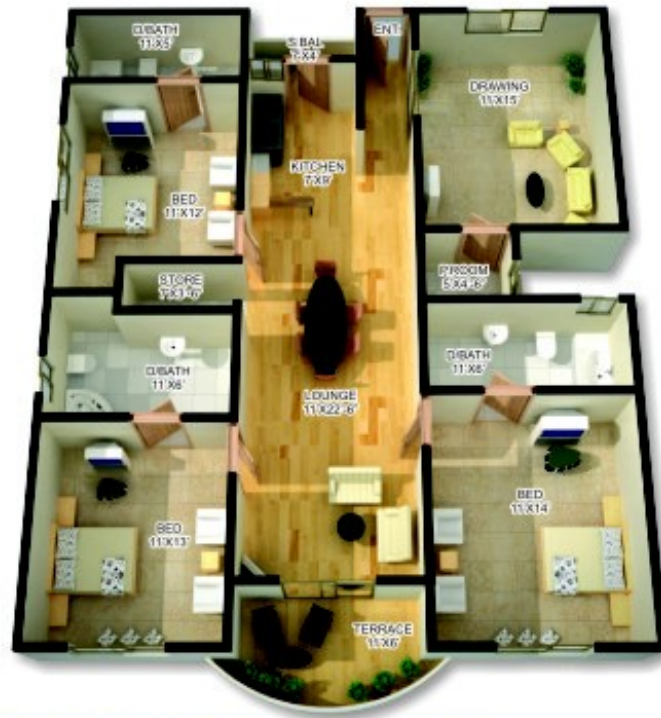
(TYPE - A)